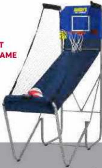
POP-A-SHOT BASKETBALL GAME

Add an interactive promotional game to your next event to get the crowd engaged and break the ice with attendees!